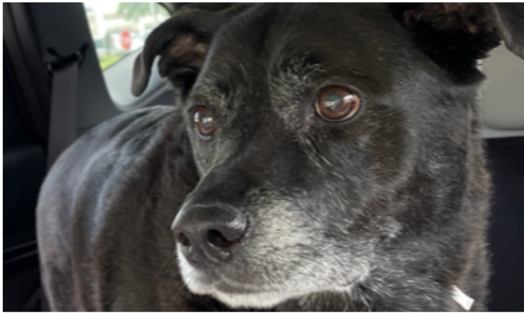
Vader the Labrador

Caring for Pets with Love & Kindness Since 1977