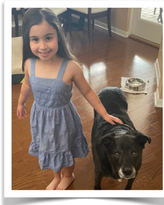
Vader and his favorite pal, Bella